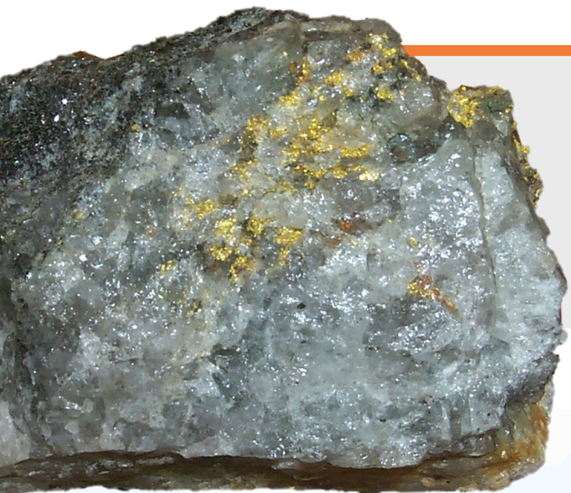
Gold-rich quartz vein from the Lingo-3 West showing