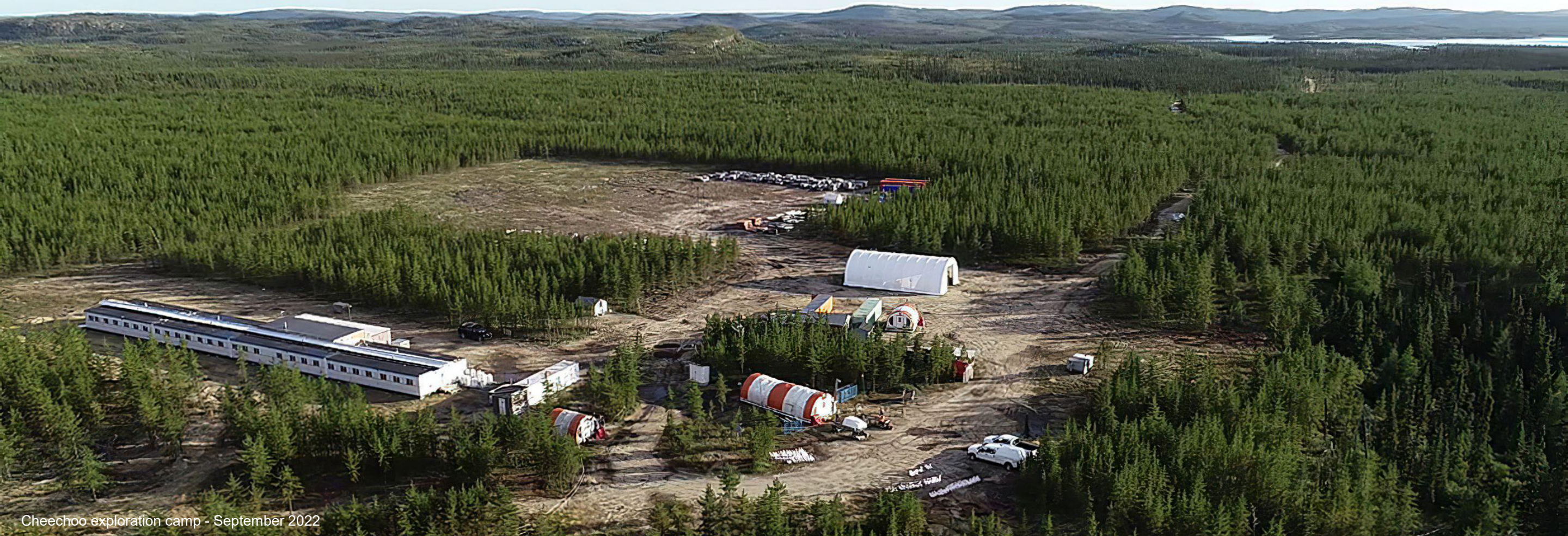
Cheechoo exploration camp - September 2022