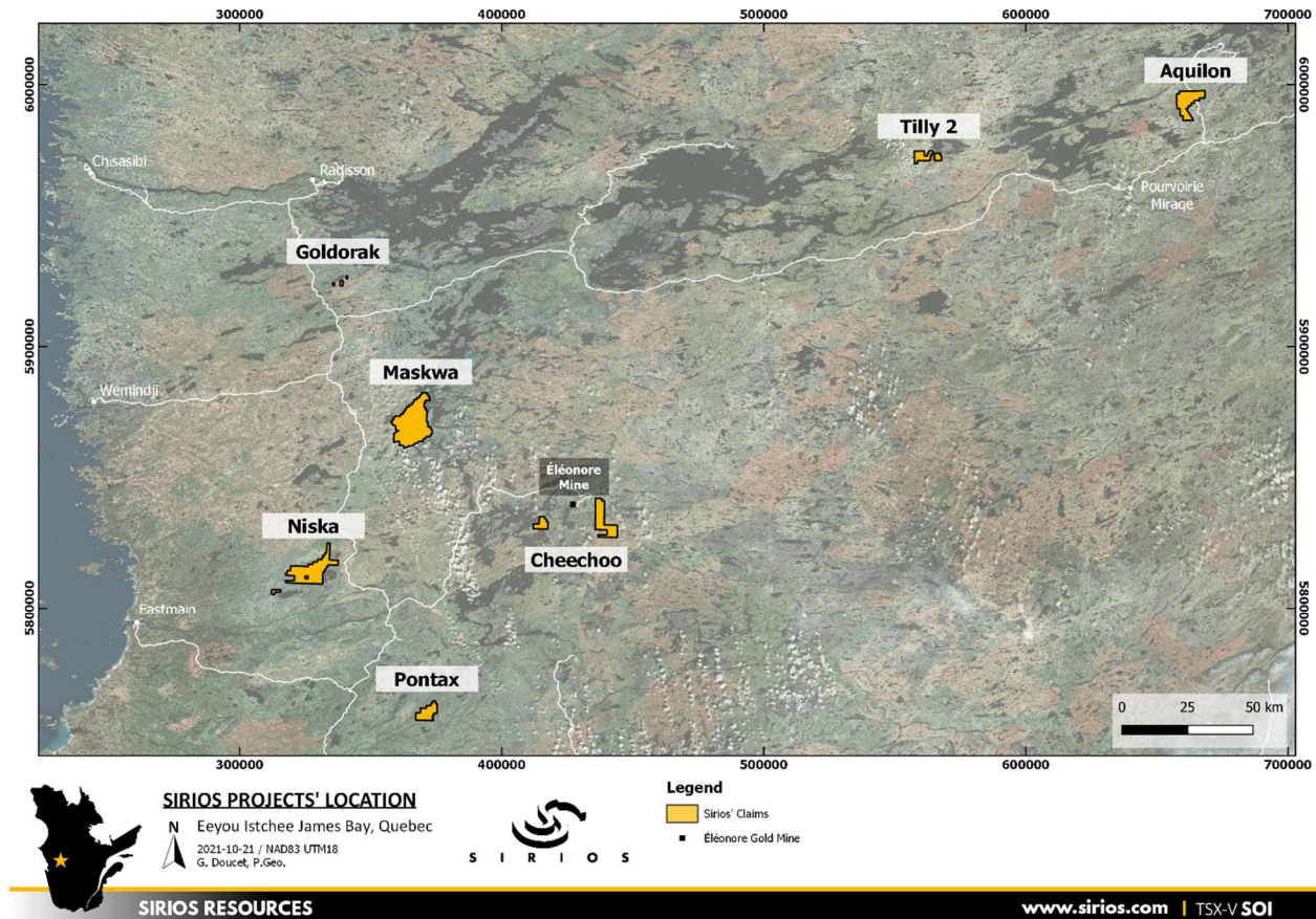
Figure 1: Location of Sirios projects