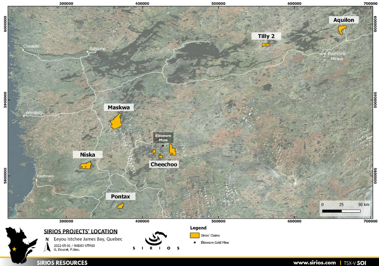
Figure 1: Location of Sirios projects